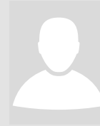
Chalernpol Leevailoj (Thailand)