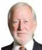
Stanley F. Malamed (USA)

Contribution of the dentist in detection of systemic diseases