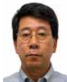
Hideo Miyazaki (Japan)

Is the Mandibular Block Passé? Medical Emergencies in Dental Practice